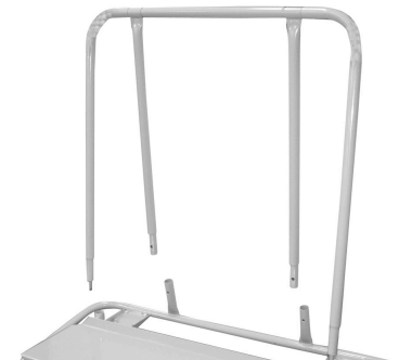
Insert Handles Into Deck