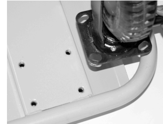
Attach Casters under Deck