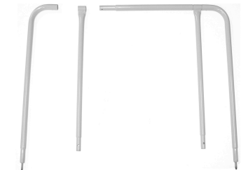
Assemble T Handles & L Handles