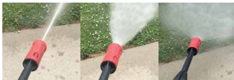
Adjustable nozzle varies from direct stream to spray.