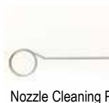
Nozzle Cleaning Pin