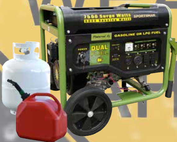
DUAL FUEL 7500 SURGE WATTS