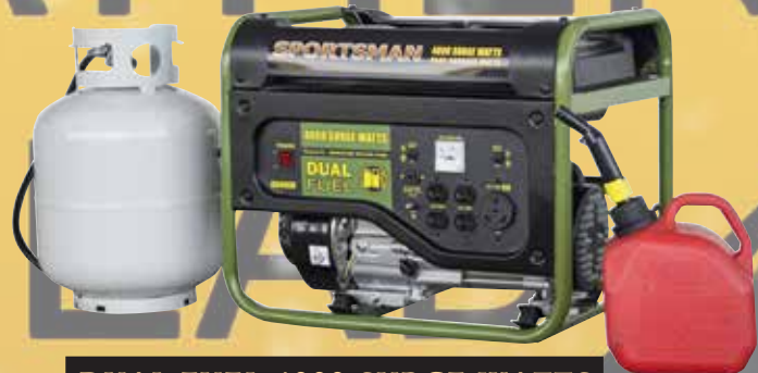
DUAL FUEL 4000 SURGE WATTS