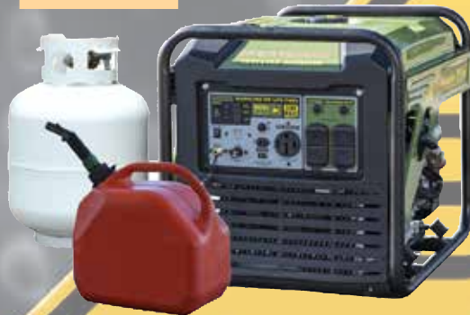
DUAL FUEL 8500 SURGE WATTS INVERTER