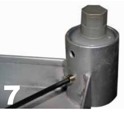
Each corner support requires two Hex screws. Wait until the table is completely assembled before securely tightening each Hex screw.