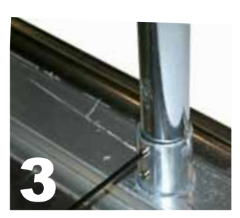
Using the Hex wrench, loosely tighten the Hex screws (with the HEX side visible) into the corner support.

After all four legs have been loosely attached, lower the adjustable table base and insert each leg through the base holes.