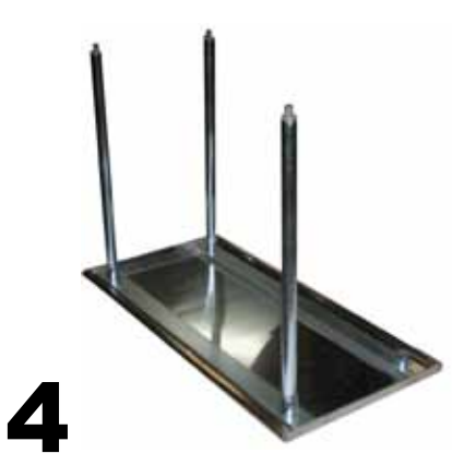
Each corner support requires two Hex screws. Wait until the table is completely assembled before securely tightening each Hex screw.