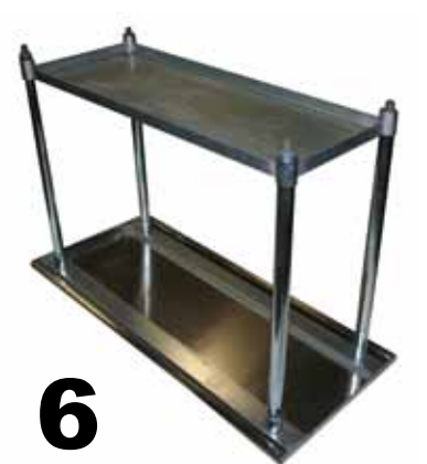
The table base is adjustable. Position it by raising or lowering it along each leg. You may choose to use the aid of a level.