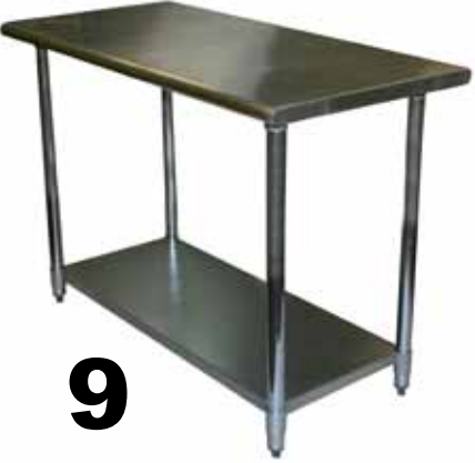
Turn the table over AFTER securely tightening each Hex screw. Two people may be required to rotate the table.