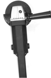
Figure 2 Bottom view show proper positioning of wheel guard

Check to be sure the grinder is unplugged.