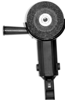
Figure 1 Top view shows handle on left side for right handed users

Always use the grinder with the wheel guard securely and properly installed. The wheel guard should always be placed between the user and the grinding wheel. An improperly installed wheel guard could result in serious injury.