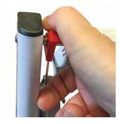
AVOID PINCH SPOT