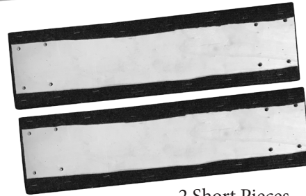
2 Short Pieces