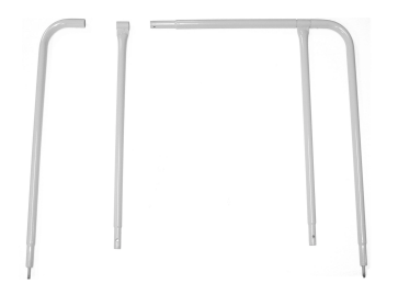
Assemble T Handles & L Handles