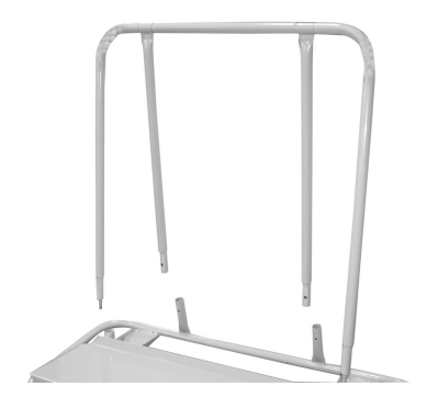
Insert Handles Into Deck