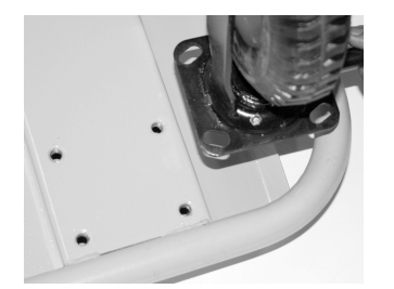
Attach Casters under Deck

If you experience a problem or need parts for this product, visit our website <a href="http://www.buffalotools.com">http://www.buffalotools.com</a> or call our customer help line at 1-888-287-6981, Monday-Friday, 8 AM - 4 PM Central Time.