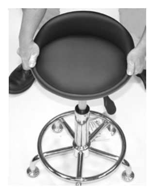
Press down firmly on seat to secure into base.

To raise and lower the Seat, grasp the Handle and pull upward without applying any weight on the Seat. To lower, raise the Handle upward by sitting on the Seat.