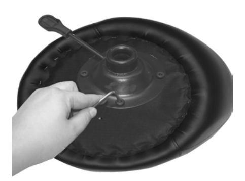
Use an allen wrench to attach the Seat Plate to the underside of the Seat with the provided Screws.