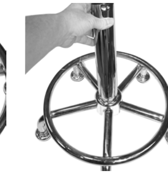
Insert the Support Cylinder into the center hole of the Footrest