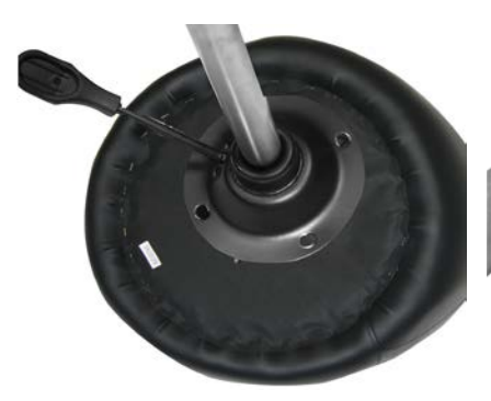
Insert the Support Cylinder into the center of the Seat Plate