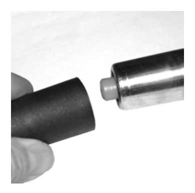
Remove the Black Cap and discard it before assembly. The Orange hydraulic button will become visible.