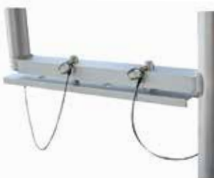
FIGURE 3) Attach Deck Bracket (F) to Rail using 2 Clevis Pins (E).