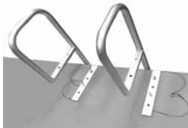
FIGURE 6 ) Attach Dock Ladder to the Deck Brackets, using Clevis Pins (E) and Release Pins (G).