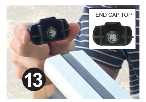
Insert key, unlock end cap, then insert. Once in place, lock end cap. Repeat on opposite side