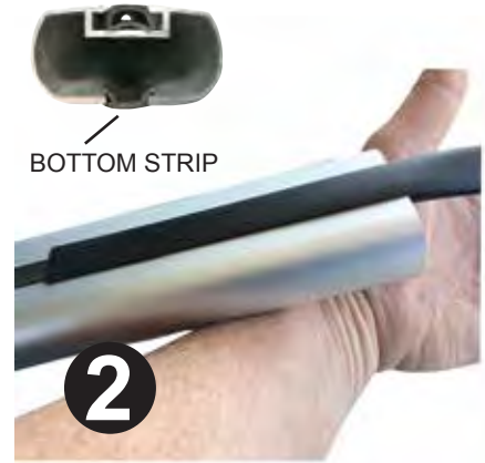
Remove Channel Strip Insert from bottom of rack