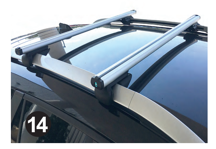
Repeat the process on back of vehicle