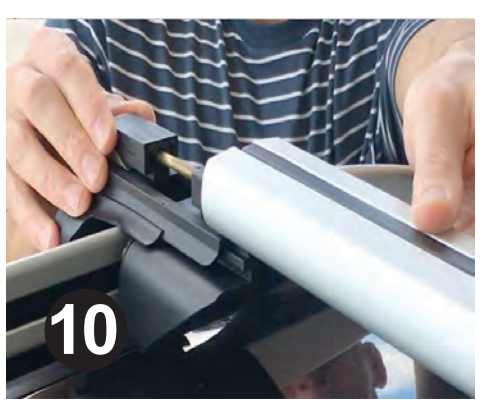
Slide rack into the support brace on the opposite side. (Trim Channel Strip again if rack doesn't fit completely )