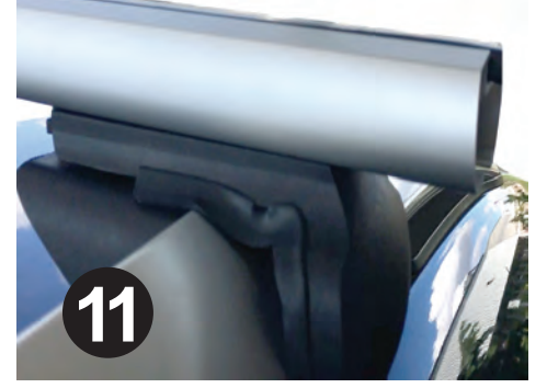
Center the rack, so it is evenly spaced between the two support braces