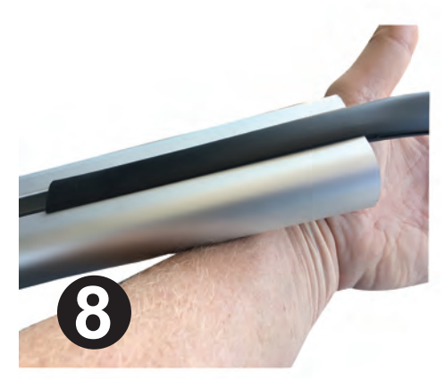
Slide Channel Strip Insert into the bottom of rack