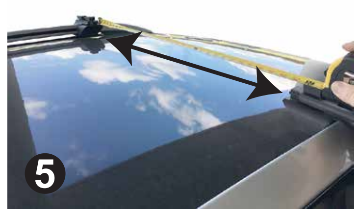
Measure distance between support braces

Attach the support brace on the opposite mount