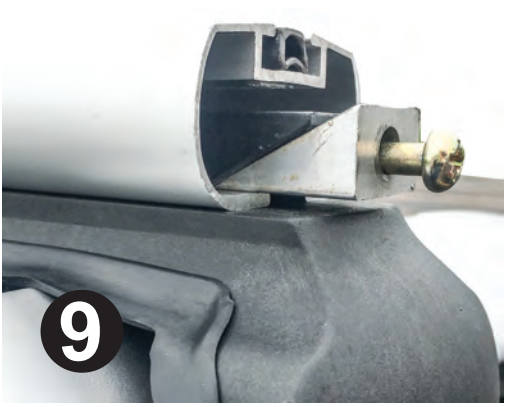
Loosen screw and slide rack, short Channel Strip Insert at bottom, into support brace