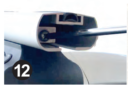
Use phillips screwdriver and tighten screw on both sides