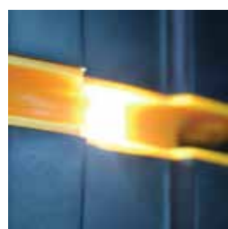
LED Light accessory powers on automatically