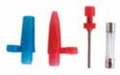
Includes: Inflatable Nozzles (2 pc), Needle, Fuse