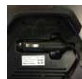
Cord Storage on Back