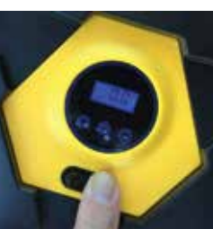
Turn on Power