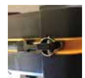
Inflator Storage on Side