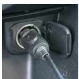
Insert into Accessory outlet. Start engine.