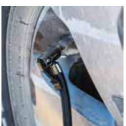
Attach to tire.